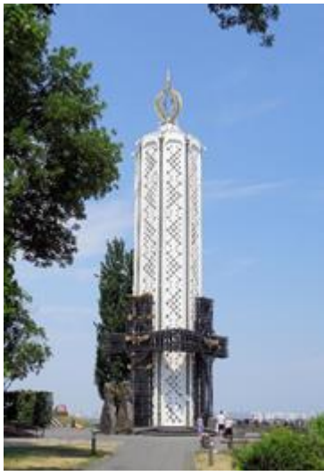
Holodomor Memorial Kyiv commemorating the great famine of 1932-33 induced by Stalin