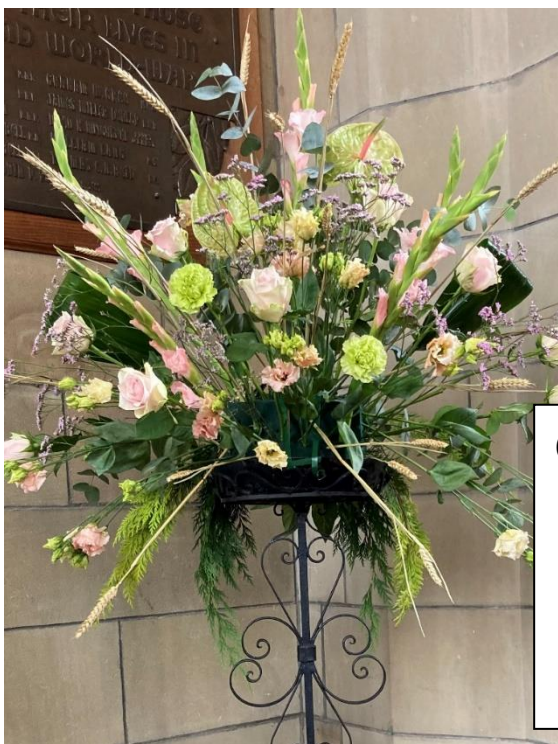
On Harvest Sunday the beautiful church flowers were augmented by ears of wheat